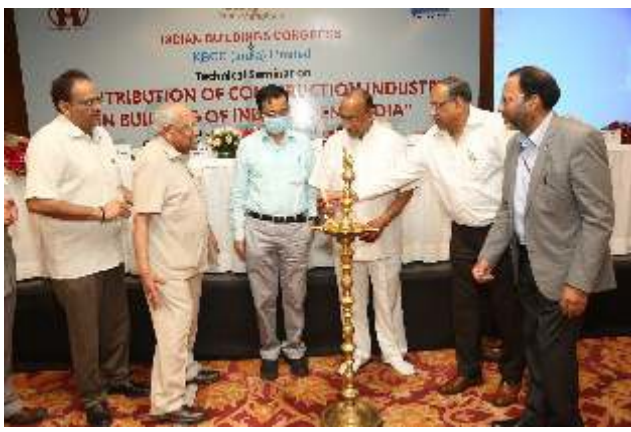
Lighting of Ceremonial Lamp

The inaugural function started with lighting of the lamp by the Chief Guest Shri