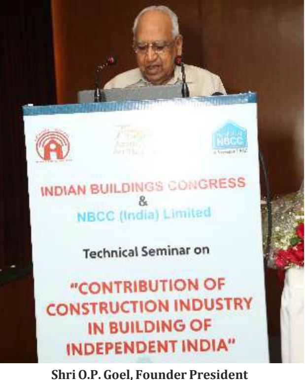
addressing the gathering

housing, water, energy and related infrastructure for the welfare of common man.